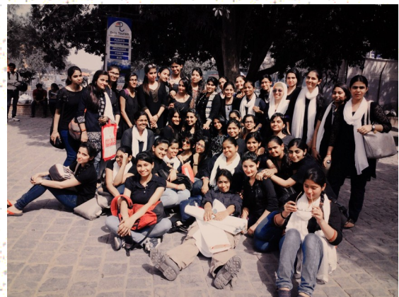
Our Fourth Year Students