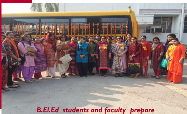
B.El.Ed students and faculty prepare

"While teaching, we can use film as a work of expressions in which we weave a story and connect it to the real life events with the students so that they can grasp the theme dealt in a contextual and interesting way."