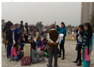
First Year Students at Slum Visit

Multifarious activities are organised for students throughout the year. Following is the list :