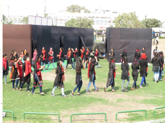
Third year students participating at the OBR Campaign at Central Park, CP.