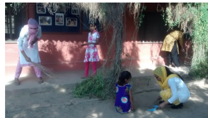
Students Participating in the cleaning of school campus

On the fourth day the group participated in the cleanliness session along with the students of the school which included sweeping of the campus, discarding of waste, watering of plants and garbage disposal. The group interacted with village people who send their children to Digantar schools. Through this interaction, students got to know about the community partnership programmes, selection and inclusion of community members for the school management committee, their extent of participation, parent teacher meetings etc. The family members