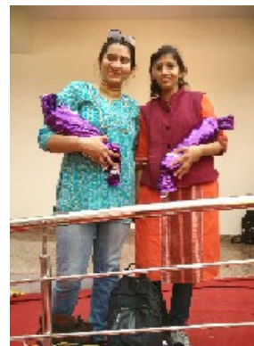
B.El.Ed faculty winning prizes at the College Sports Day

to leave for Nagar Kirtan on the occasion of Guru Nanak Jayanti