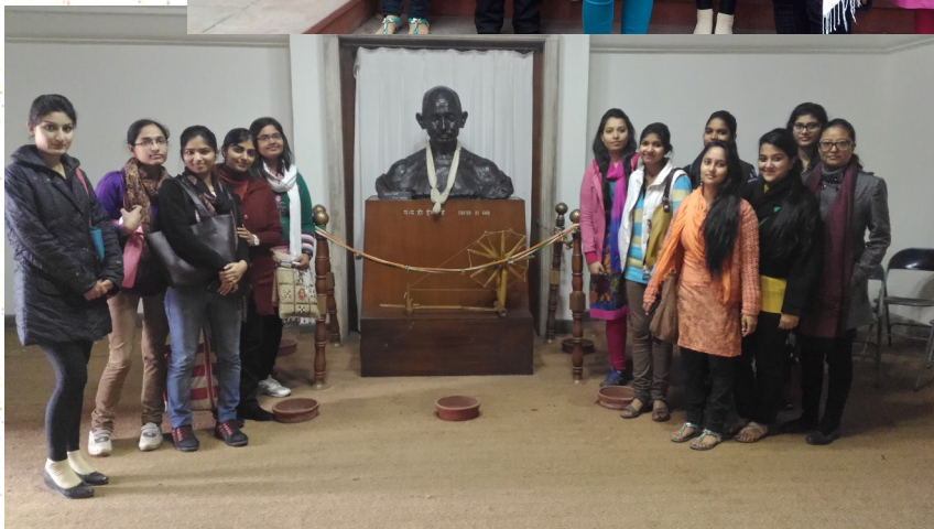
Fourth year students at the Gandhi Museum..