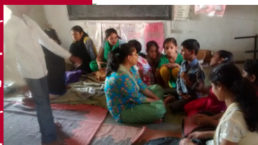
Third Year Students Inter- acting with Digantar School Stu- dents

An excursion to some famous sites in Jaipur such as the Jaigarh Fort, Jal Mahal was organised for the students on the third day of the visit to know about the rich historical and cultural heritage of the city.