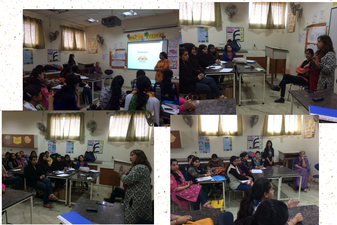
Faculty from BNPS , Presidium and Ahvaan Foundation orient the fourth year students during Placement