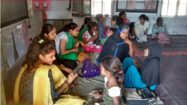
Students interacting with school kids at Digantar School

Digantar is one of the well known non- profit educational institutions of India working with a vision of creating pluralistic democratic society that safeguards justice, equality , freedom and dignity of all. We B.El.Ed 3rd year students visited innovative school Digantar from 5 to 10 October 2015.