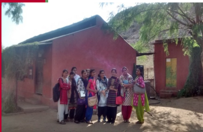
Students at Digantar School

Along with the learning from the visit, we also got an opportunity to interact more closely as a group. During and post the visit the bond among students and between students and teachers has strengthened further. It was indeed a memorable and very enriching experience for all of us.