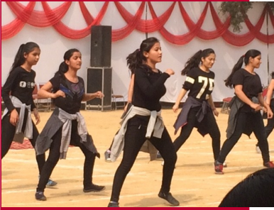
Second Year students participate in the College Sports Day

An August evening it was, Blue skies hid behind the clouds. Dark clouds! Each with its unique shade of grey, As if had a tearjerker to say; As if were about to cry, with another blink of an eye. Soon a drop fell on my cheek. Cold and numb! That I wiped away with my thumb. Then another on my hand,