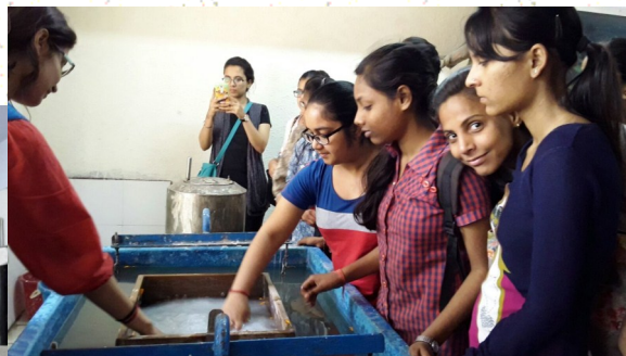
First year students at