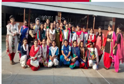
Faculty and students at one of the Digantar Schools

The department of Elementary Education organised a visit to Digantar, Jaipur for B.El.Ed third year students as a part of their compulsory practicum. The visiting group comprised of 47 students and 4 faculty members from the department. Digantar Vidyalaya is an organisation which is working towards development of alternative and innovative educational programs for children in rural areas of Jaipur. On the 5 th of October the group left for Jaipur by Ajmer Shatabdi. The students along with the four faculty members were received by a representative from the organization who were then taken to the Digantar campus. Arrangement for stay was made in well furnished dormitories with provision for all basic amenities. After the lunch, an orientation session was conducted by the resource persons. They were told about the historical background, philosophy and the vision of the organization, the ups and downs witnessed by the organization and the efforts it was making to maintain its existence.