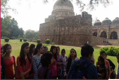
First year students Visit Lodhi Gardens for Heritage Walk.

एक स्त्री पूछती है दूसरी स्त्री से, किसने बनाई इतनी परम्पराएँ इस जीवन मे ? क्यों एक स्त्री है घुट - घुट कर जीती , सारे दुख- दर्द खुद है पीती? क्यों इतनी बंदिशों से जकड़ी हूँ मैं, क्यों इस तरह पली बड़ी हूँ मैं? हमेशा स्त्री ही दे क्यों बलिदान , क्या सिर्फ माँ की है