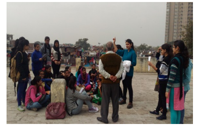
First year students at