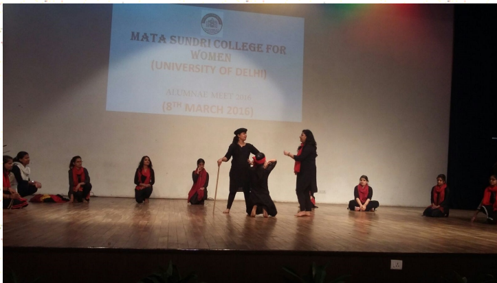
Meri Awaz a play on women empowerment performed by third year students at the college alumni meet .