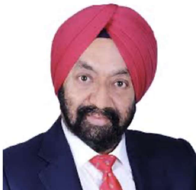
S. Vikramjit Singh Sahney, Chairman