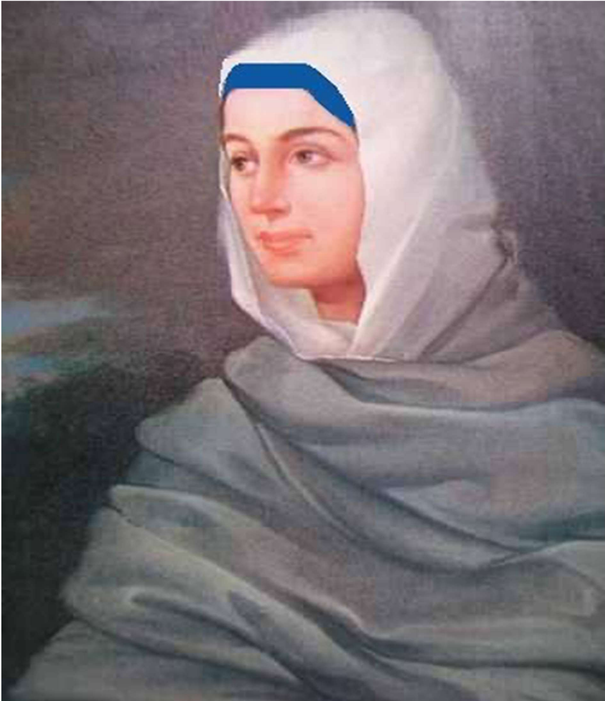
MATA SUNDRI JI