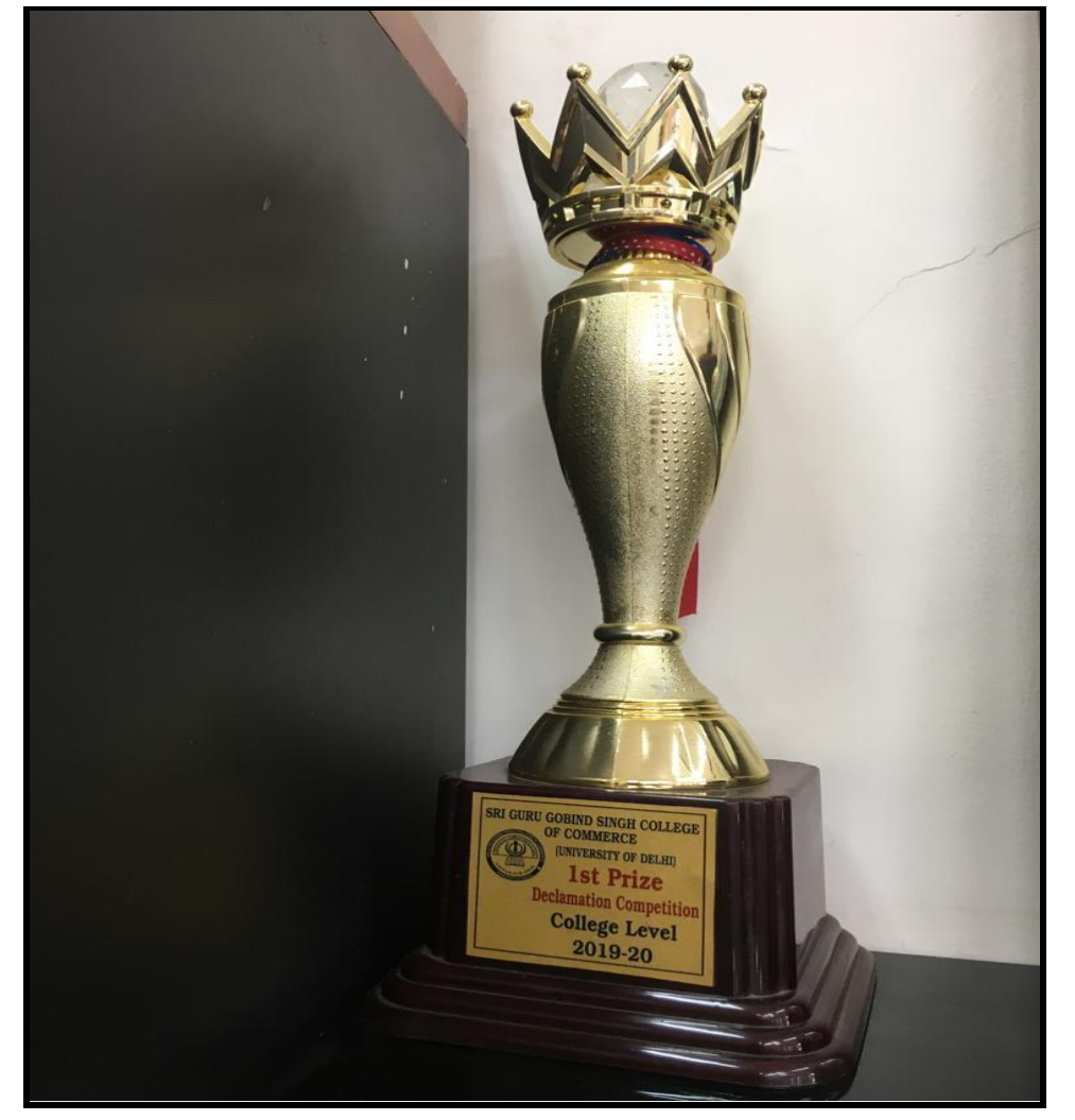
Image: 1st prize in Declamation Competition College level (2019-20)