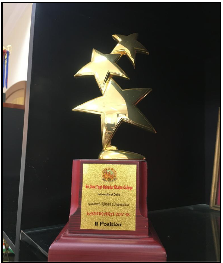
Image : Award received in the 'Gurbani Kirtan' Competition LASHKARA (2017-18)