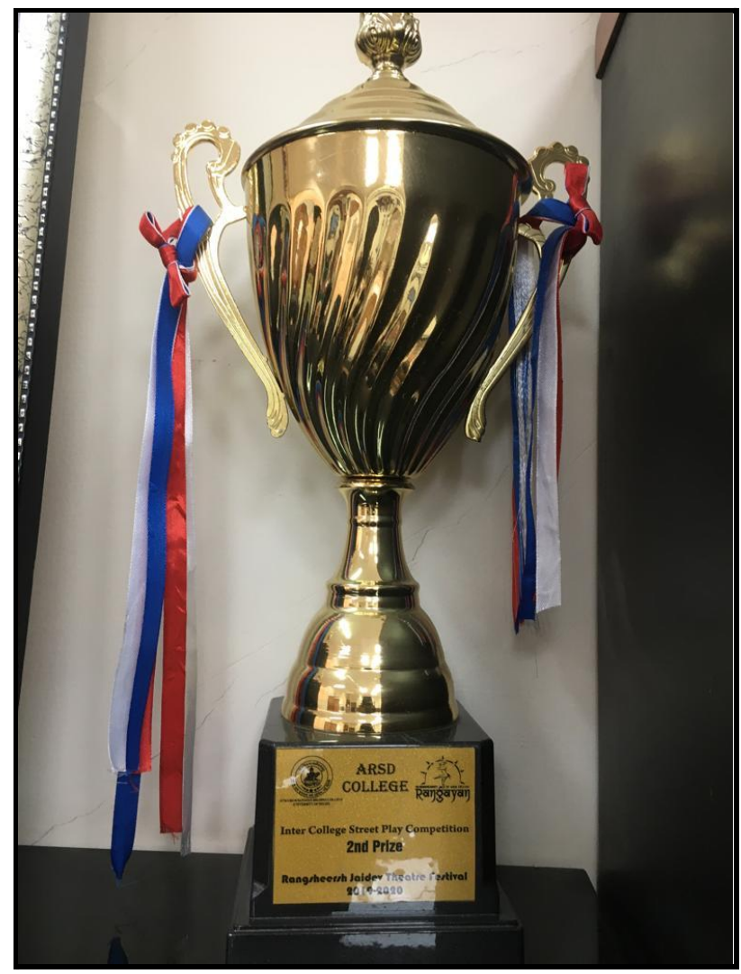
Image: 2nd prize in Inter Colleges street play competition "Rangsheersh Jaidev Theatre Festival" (trapped in a cell phone) (2019-20)